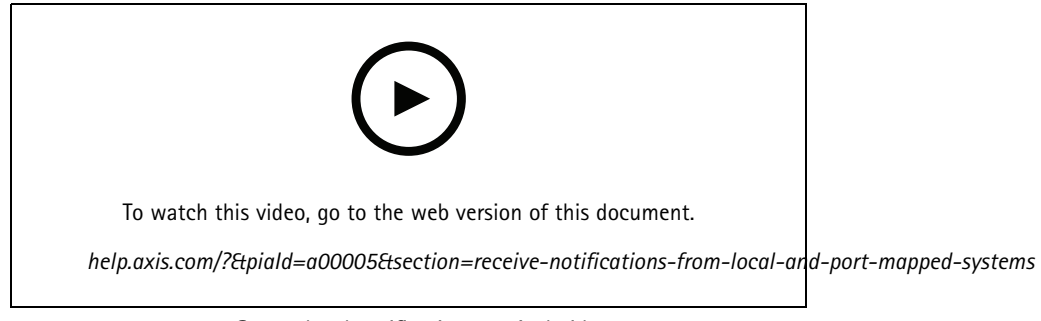
Set up local notifications on Android

Receive notifications from Secure Remote Access systems