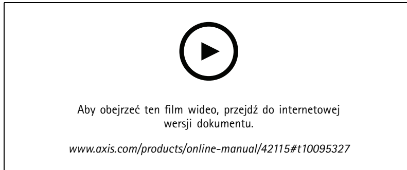
How to upgrade the firmware

AXIS Device Manager can be used for multiple upgrades. Find out more at axis.com/products/axis-device-manager .