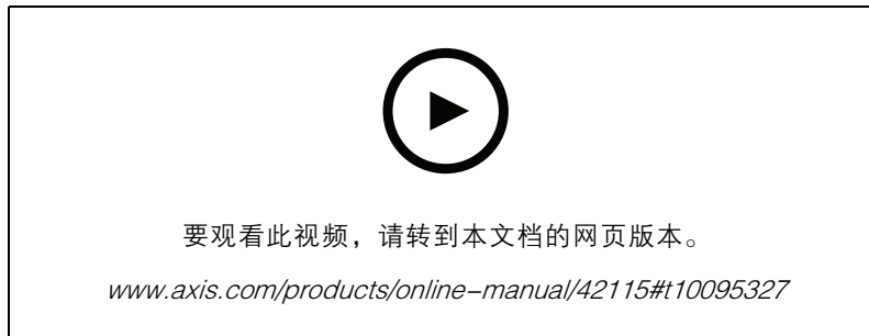
How to upgrade the firmware

AXIS Device Manager can be used for multiple upgrades. Find out more at axis.com/products/axis-device-manager .