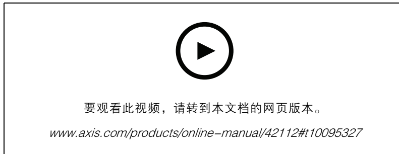
How to upgrade the firmware

AXIS Device Manager can be used for multiple upgrades. Find out more at axis.com/products/axis-device-manager .