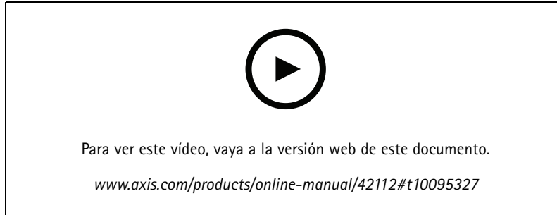
How to upgrade the firmware

AXIS Device Manager can be used for multiple upgrades. Find out more at axis.com/products/axis-device-manager .