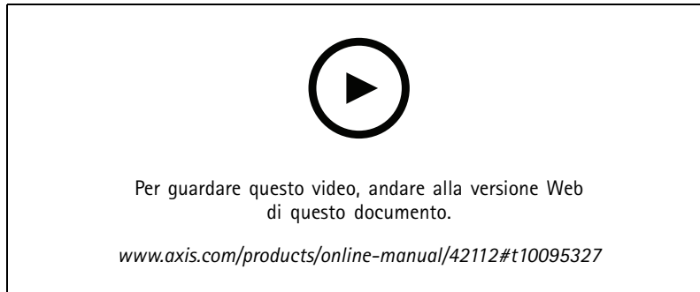
How to upgrade the firmware

AXIS Device Manager can be used for multiple upgrades. Find out more at axis.com/products/axis-device-manager .