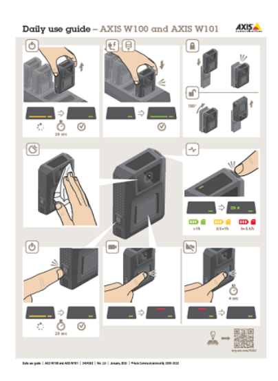
Daily use guide