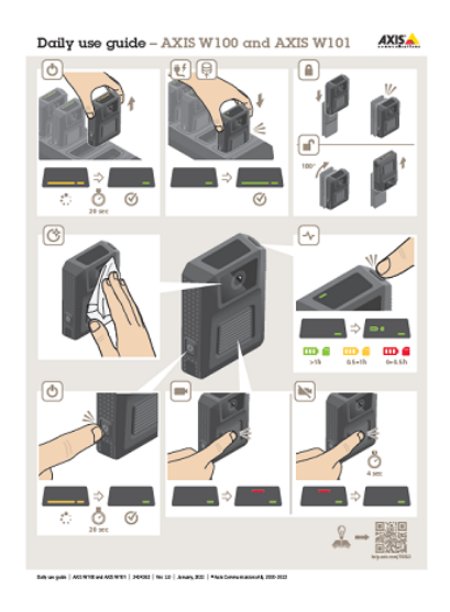
Daily use guide